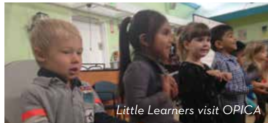
Little Learners visit OPICA

Why is having young people at OPICA important? First of all, it enriches the experience of our members. There is nothing like having a small child hold your hand or watching school kids perform. Adults with memory loss and decreased mobility often have fewer opportunities to be around children—and so we bring children to them.